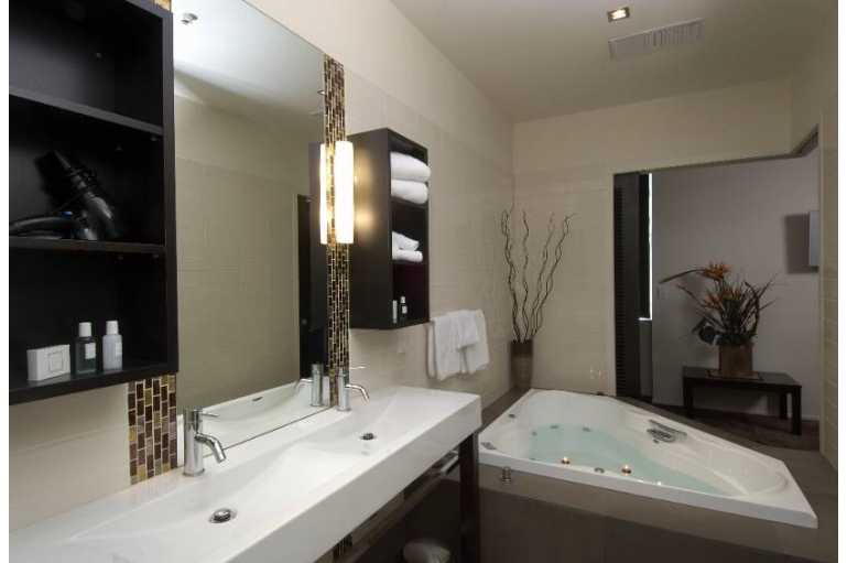
1 x Deluxe Suite