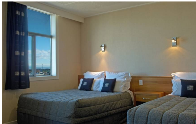
57 x Standard Rooms